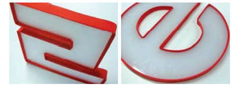
channel letter samples

Advanced technology. SDS Korea's channel bender system has accurate and excellent bending and cutting technology. This is made possible through many years of experience in developing diemaking systems and our enormous investment in research and development. Our products offer unique functions - unseen in other competing products - and are the result of many key patented technologies. SDS Korea is devoted to improving any technology that is needed to serve our customers. With our systems, customers can increase productivity and substantially reduce costs, including labor cost. Furthermore, we are upgrading our systems continuously to meet new demands that are emerging in the market. Customers can, therefore, select any SDS channel bender system without hesitation as we are in tandem with market needs, current and future.